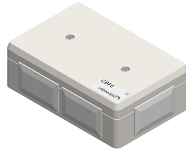
CBFE – Fan coil unit control box

CBFE is connected to a controller that supplies the control box with voltage feed and control signal.