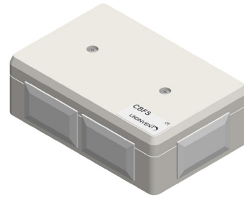
CBFS – Fan coil unit control box with stepped motor.