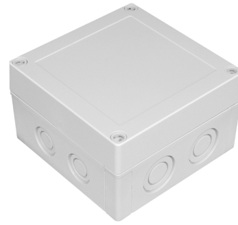
EFK – Electrical interlocking contactor.

EFK may be ordered as an accessory and safety equipment for fume cupboard or downflow bench control. The contactor may be fitted for example to fume cupboard controller FCL which can cut the power to connected branch connectors in the event of an alarm of incorrect air speed in the hatch opening of the fume cupboard. The switch is reset manually via FCL and connected fume cupboard monitor FLOCHECK V.