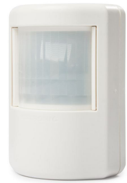
PD-2400. External occupancy detector 24VDC/VAC.