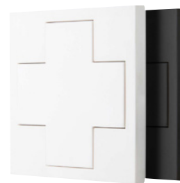
DSC – 4-way DALI Switch