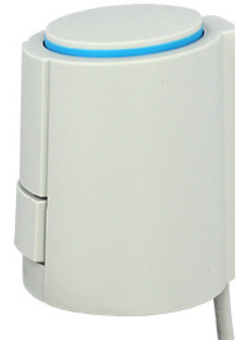
Valve actuator A40405 without adapter ring.

See the product description for adapter rings for a list of a selection of adapter rings for valves in normal use. VA32, VA54, VA78 and VA80 can normally be ordered from Lindinvent.