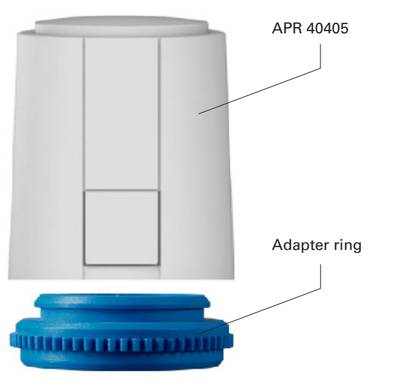
Valve actuator APR 40405 and adapter ring.